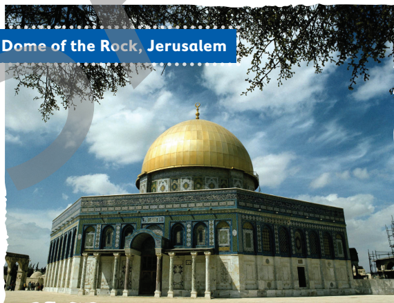
The Dome of the Rock, Jerusalem

David's son Solomon built the temple on Mount Moriah. Solomon placed the Altar of Burnt Offerings on the spot where David had offered sacrifices. The sacrifices of burnt offerings in the temple pointed